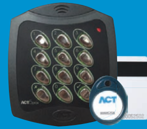
ACT 5prox Digital Keypad & Proximity