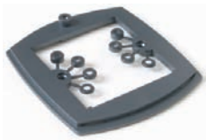
Flush Mount Plate