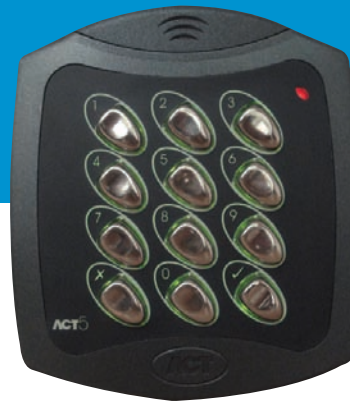
ACT 5 Digital Keypad