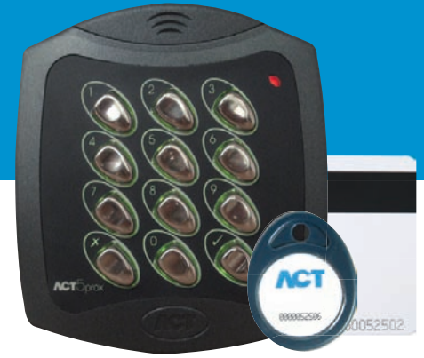
ACT 5prox Digital Keypad & Proximity