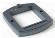
Surface Mount Collar