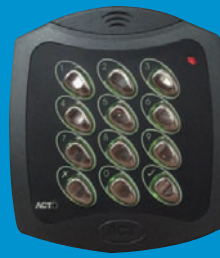
ACT 5 Digital Keypad